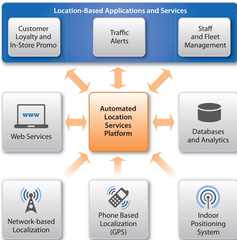
Figure 2. Examples of the many systems which must be integrated by the Automated Location Services Platform in order to support a wide range of location based applications and services.

Finally, the top layer of Figure 2 shows that many different types of applications can be supported by the platform. By providing a consistent API and development environment to all the underlying tools, application development can occur rapidly. While the automated LBS platform was designed with the intent of supporting advanced applications and the continuous localization they require, on-demand location applications and services can also benefit from integration with the platform. Almost all LBS have the need to manage server interactions, handle privacy concerns, handle billing and payment services, support processing and execution servers, and store and log data.